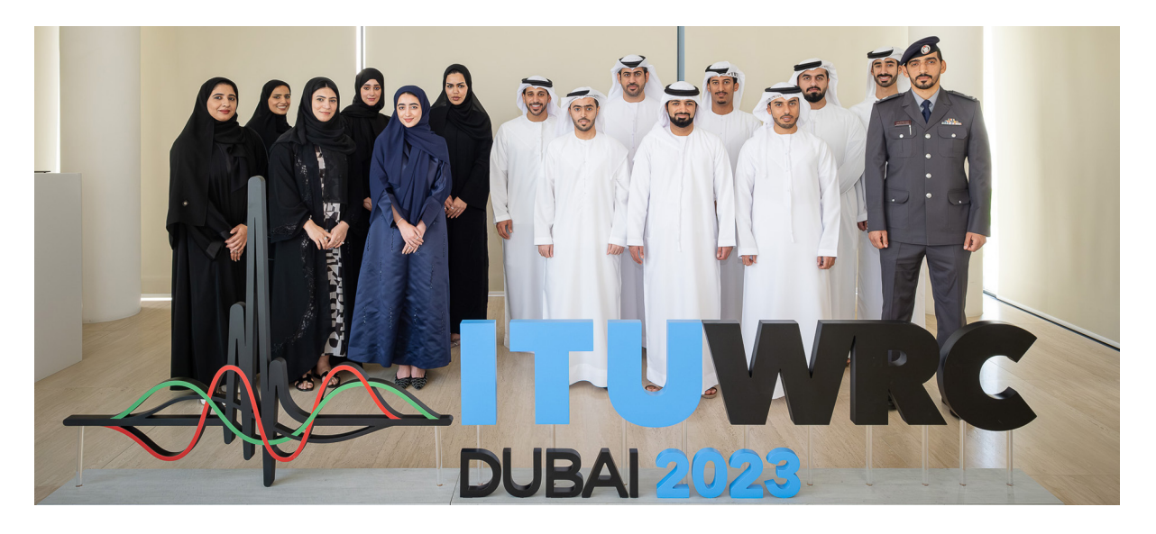
TDRA Youth Council Organizes an Awareness Workshop on WRC-23 in the Presence of UAE's Youth Councils